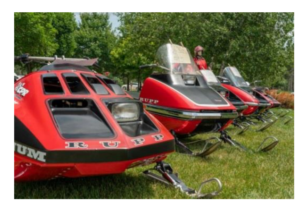
SAVE THE DATE! MORE INFORMATION COMING SOON!