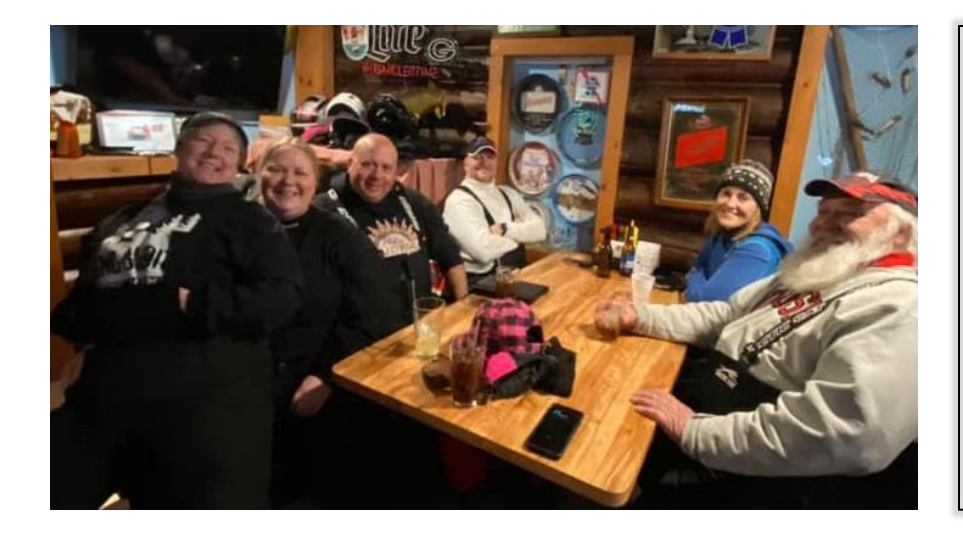
Miles & Smiles Memories & Friendships Made