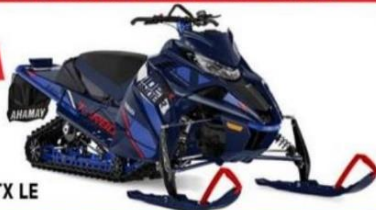
YAMAHA SIDEWINDER XTX LE

6821 Highway 54 East • Wisconsin Rapids, WI (715) 424-1762 • DonahueSuperSports.com