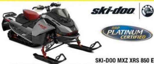
SKI-DOO MXZ XRS 850 ETEC

BOTTOM LINE PRICING. NO HIDDEN FEES. PERIOD.