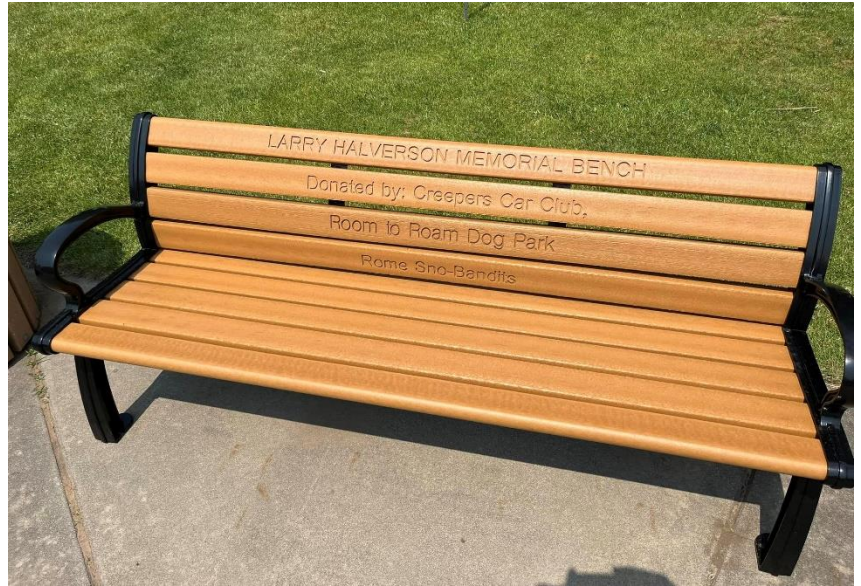
2021 Car Show