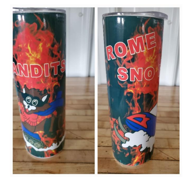
Tumbler available. 20 oz for $20, 30 oz for $28 and kids 12 oz for $20. Either design can go on the tumbler or they can be personalized. Backgrounds can be changed.