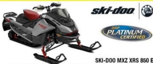
SKI-DOO MXZ XRS 850 ETEC

BOTTOM LINE PRICING. NO HIDDEN FEES. PERIOD.