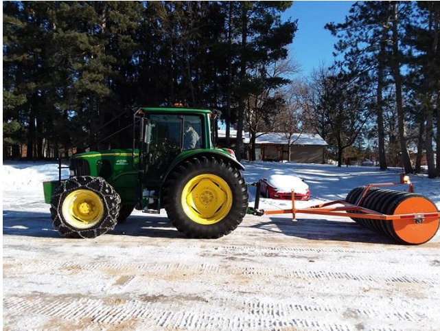
Our club roller hit the trails for the first time this season on January 17 th .