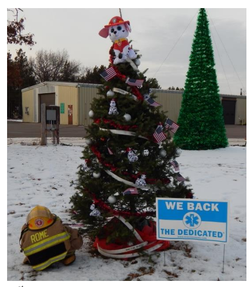
1<sup>st</sup> Place in the Tree decorating competition went to the Rome Fire Department. Thank you to the local businesses that participated!