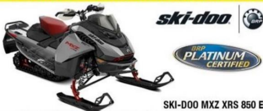
SKI-DOO MXZ XRS 850 ETEC

BOTTOM LINE PRICING. NO HIDDEN FEES. PERIOD.