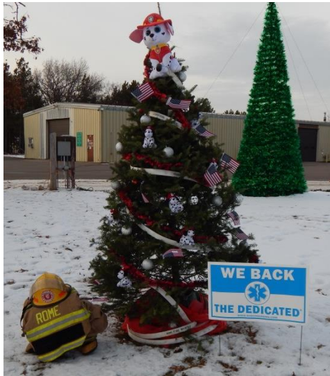
1 st Place in the Tree decorating competition went to the Rome Fire Department. Thank you to the local businesses that participated!